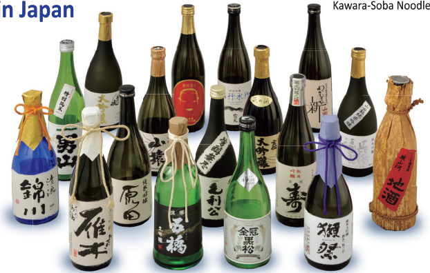
Local Yamaguchi Sake