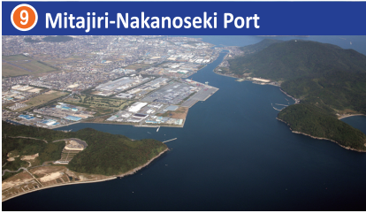
9 Mitajiri-Nakanoseki Port