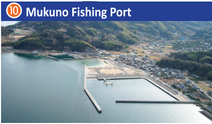
10 Mukuno Fishing Port