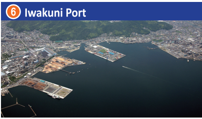
6 Iwakuni Port