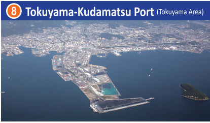
8 Tokuyama-Kudamatsu Port (Tokuyama Area)