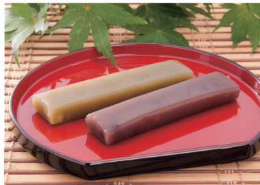
Uiro Sweet Paste Jelly