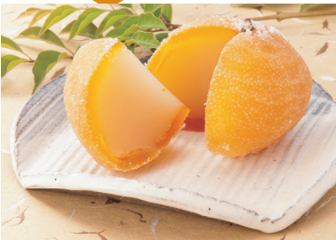
Natsumikan Orange Sweet

Famous and specialty foods from Yamaguchi – known as one of the great treasures of dining in Japan